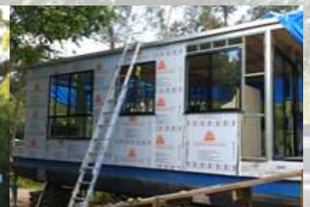
Side panels going on