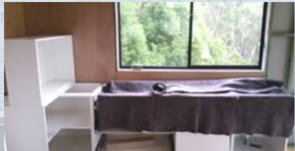
Start of the kitchen