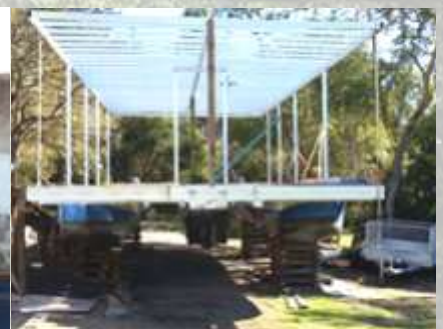
Frame and roof