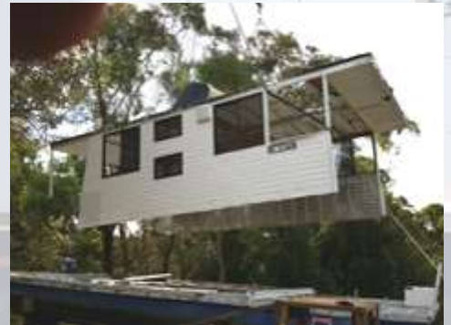
Lifting the frame off