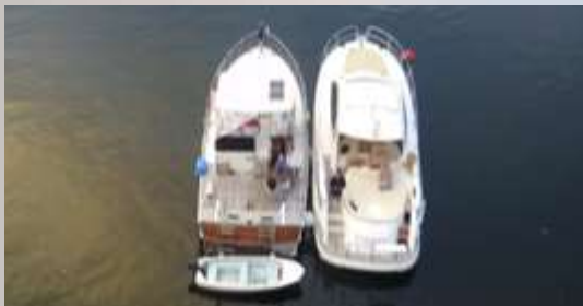
DJI Mavic Pro on take off. Location: Joes Crafts Bay

Upon launch, the stability control kicks in straight away with a 6 metre height calculation. This allows the drone through GPS readouts to locate the exact location from where it took off so in the event of an emergency, the drone will land in the exact spot where it took off.