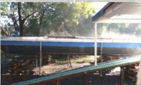
Back to basics