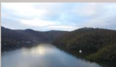
View 90 metres in the air over Joes Crafts through to Collingridge Point.

Flight and range specs are also pretty impressive. DJI equipped the Mavic with an all-new video transmission system called OcuSync, which stretches the Mavic's max range to over 4 Km and also boosts its resistance to interference. At shorter ranges, this tech can even stream footage to you at 1080p resolution, allow photo and video downloads at 40Mb/s – which is absolutely nuts. We could have had the drone video enroute back to Berowra Waters Marina or Deep Bay – amazing.