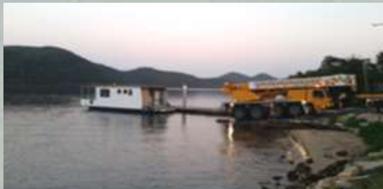
Craned in at Mooney Mooney