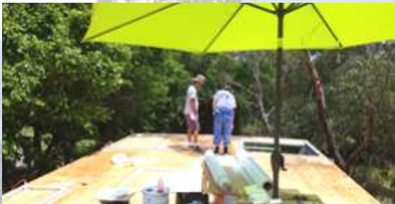
Upper deck fibreglassing