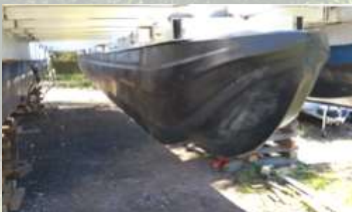
New flotation pods