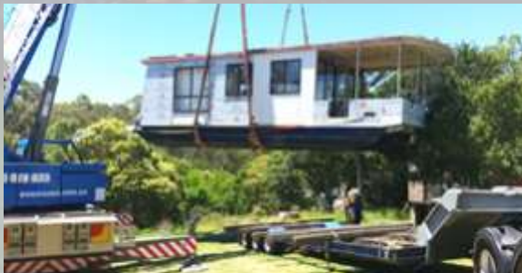
Back onto the truck