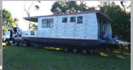
Back to the water