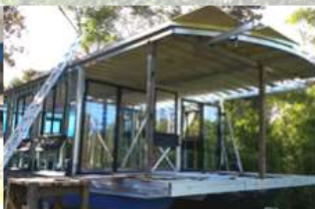
Roof going on