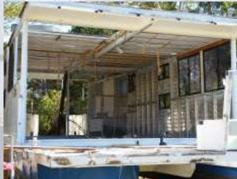
Demolition almost done