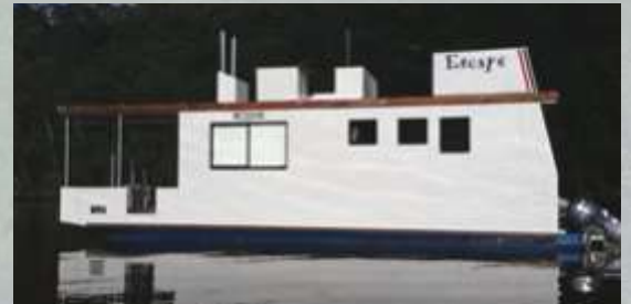
Back on the mooring