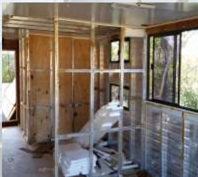
Demolition partially done

Behind the kitchen is a full sized shower and change room, separate house-sized toilet and vanity, and the stairs to the upper deck, under which is a hanging wardrobe, and storage.