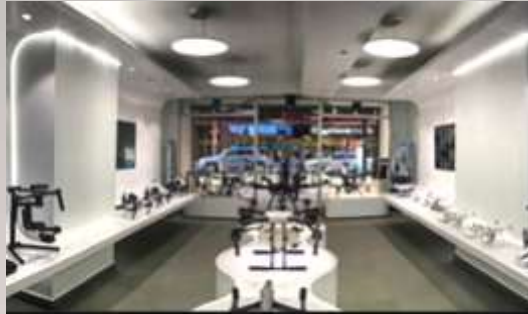
DJI New York Store off Broadway

Middle of last year I was walking through Broadway, New York City on my way to my office when I came across a store called DJI. With a crowd of people surrounding the store, I had to stop and see what the fuss was all about. Being in the technology game and having a good knowledge of photographic technology, I couldn't believe what I saw. Here was an entire store dedicated to Drones – flight apparatus used to take aerial videos and photographs. Only in New York City – I love this city! The drones that they were offering were so compact, they could fit into backpacks and it was amazing to see such a wide variety of people wanting to use test them out in store. I had to have one.