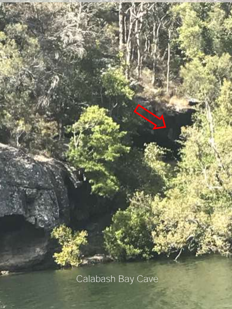
Calabash Bay Cave