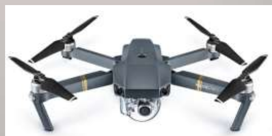
Article by Cameron Daley

All in all, the DJ Mavic Pro will allow you to see the boating world from a completely different angle. I give this unit a 10/10 for stability, 8/10 for ease of use when launching and landing and 10/10 for recording and photo taking.