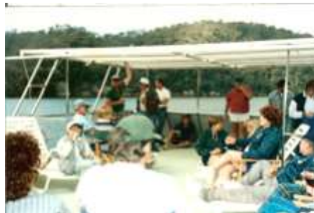
Post AGM Party aboard Tiamo

Either "surrendering" or "receiving" a bottle of champagne