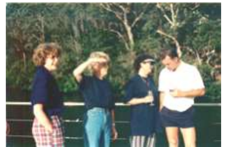
Post AGM on board Tiamo