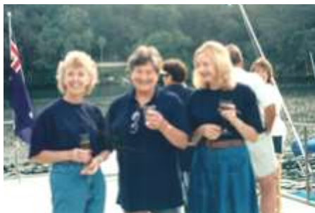
Early Club Members