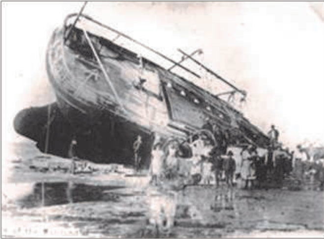
The day after – the wreck of the SS Maitland