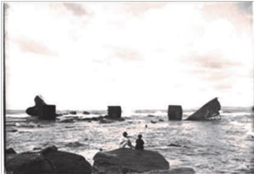
Remains of SS Maitland