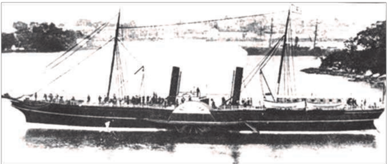
SS Maitland