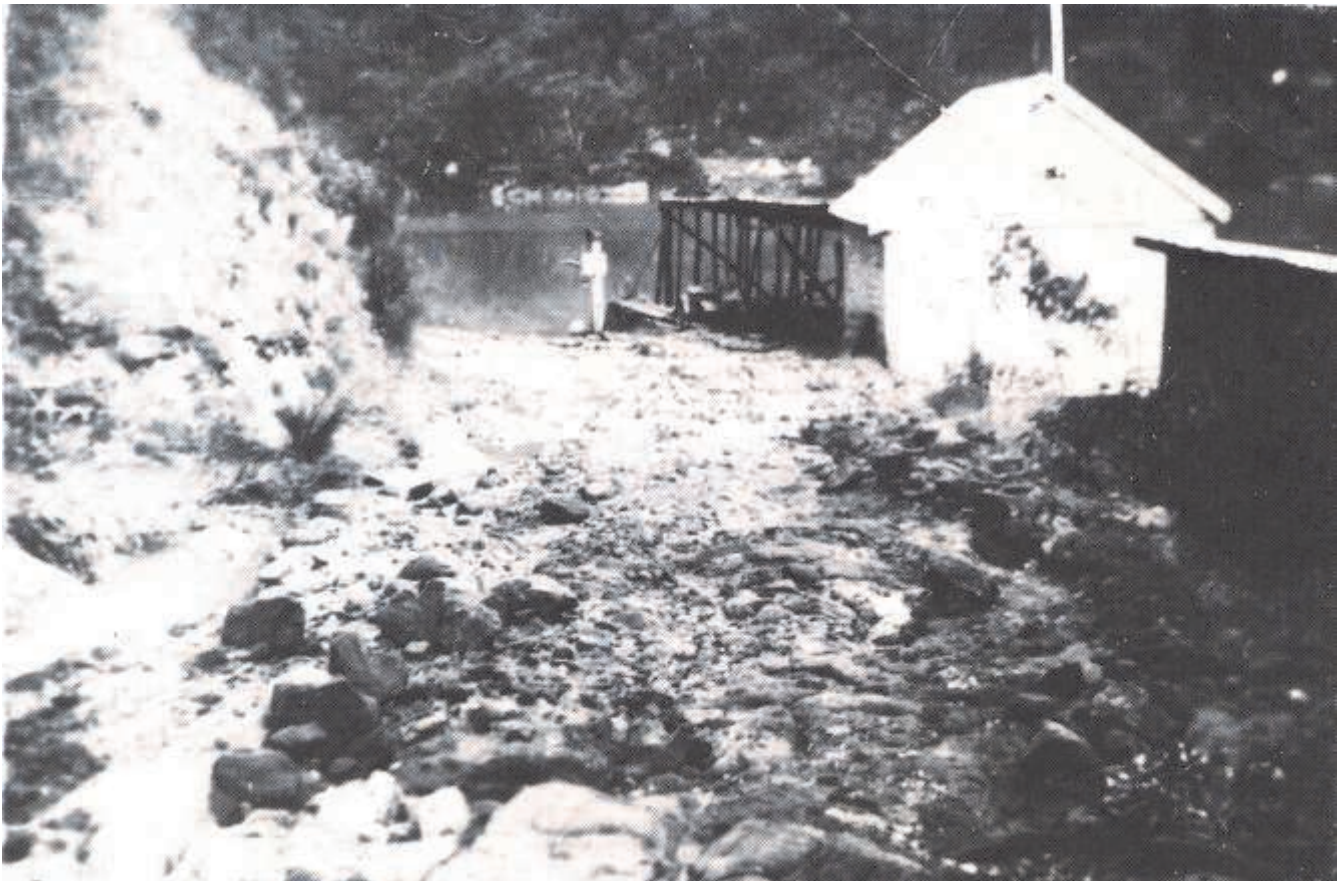
This photo was taken circa 1930 but easily recognised today by anyone who knows and loves Berowra Waters. Do you recognise this location???? Answer on back cover