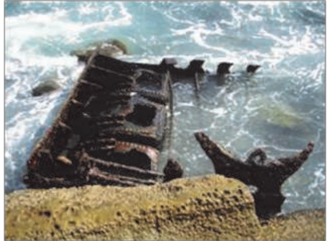
Remains of SS Maitland